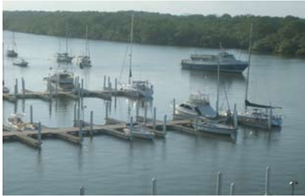
Pg. 55: New marina in Puntarenas back lagoon is called Puerto Azul.

A: 12°35.653'N by 087°25.563'W. The sea buoy is Waypoint B: 12°36.570'N by 087°22.430'W, and boats coming from SE have straight shot to Waypoint B. Then the first channel buoy in Estero Aserradores (channel 8' depth at LLW) is Waypoint C: 12°36.830'N by 087°20.930'W. Ask marina (VHF 16) for free Pilot Service. Officials come to this marina to perform your Nicaraguan clearance. We've stopped here several times, love the place & people, good fuel; good reports from others too.